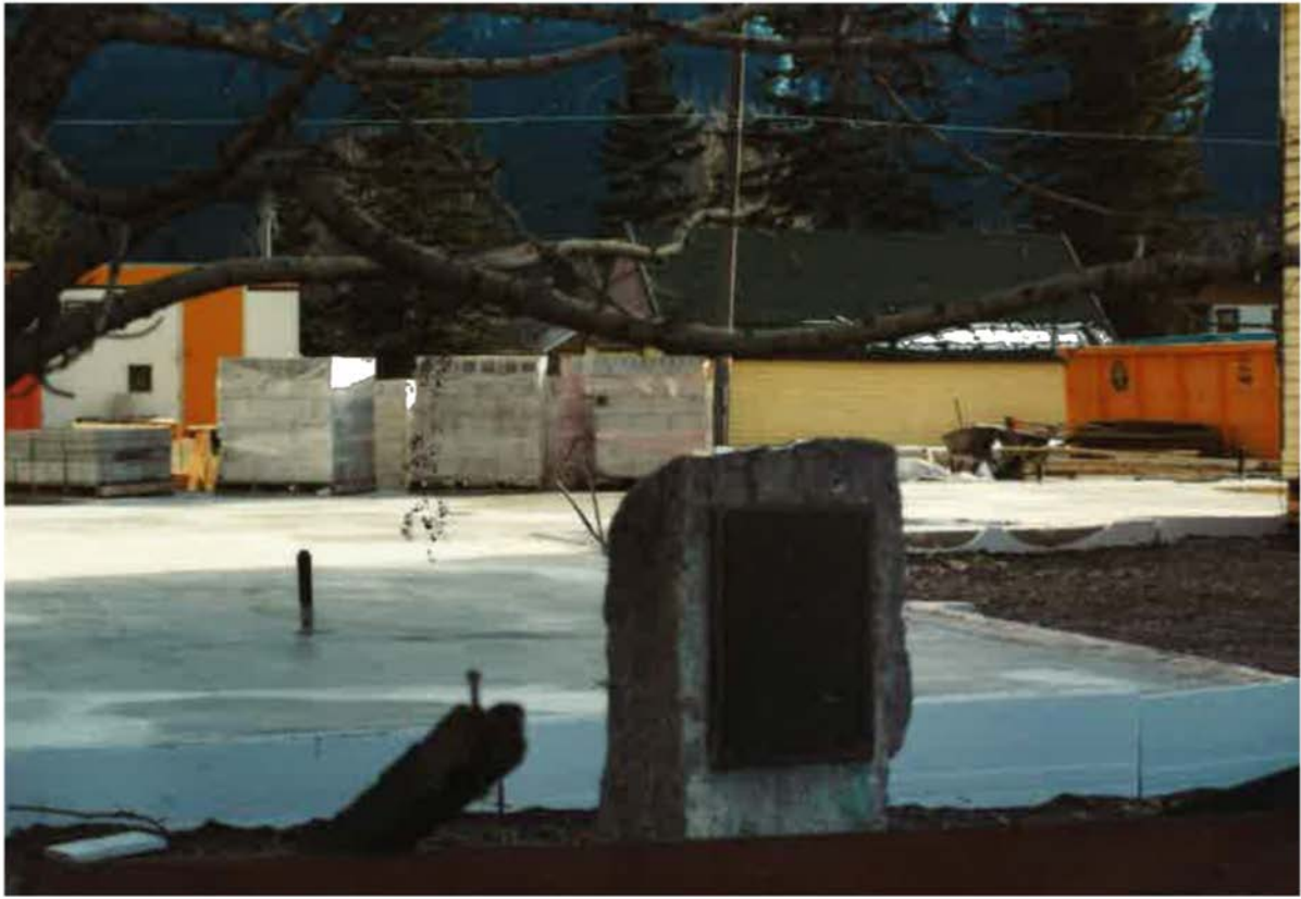
New pad for hall poured