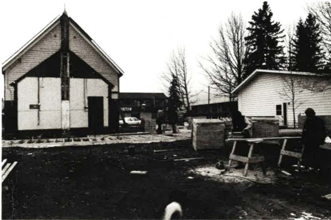
Old hall removed