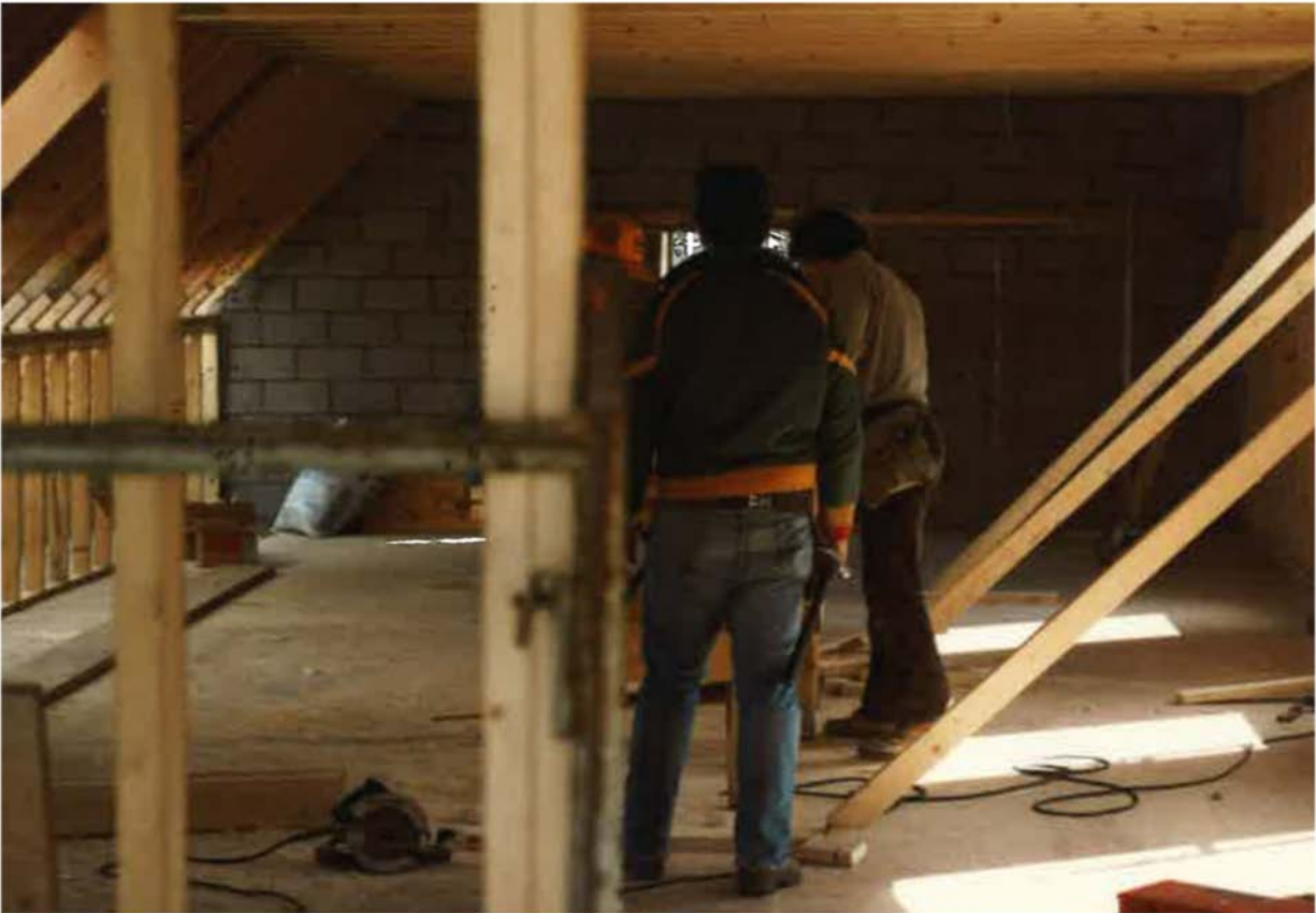
New Hall construction