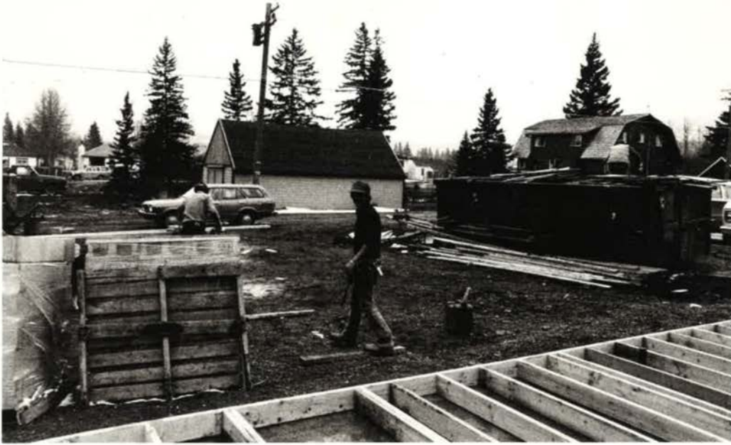
First forms for hall foundation