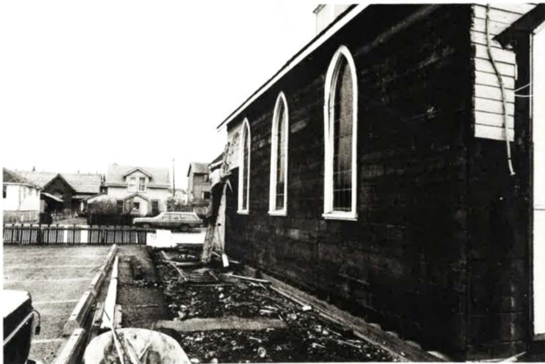
Stripping off old siding