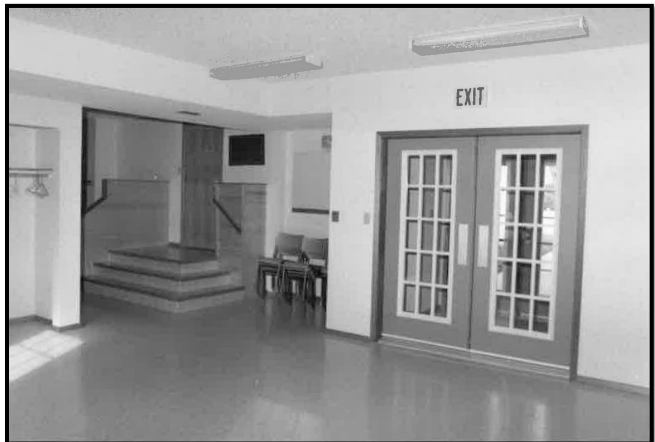
New Entry (below)