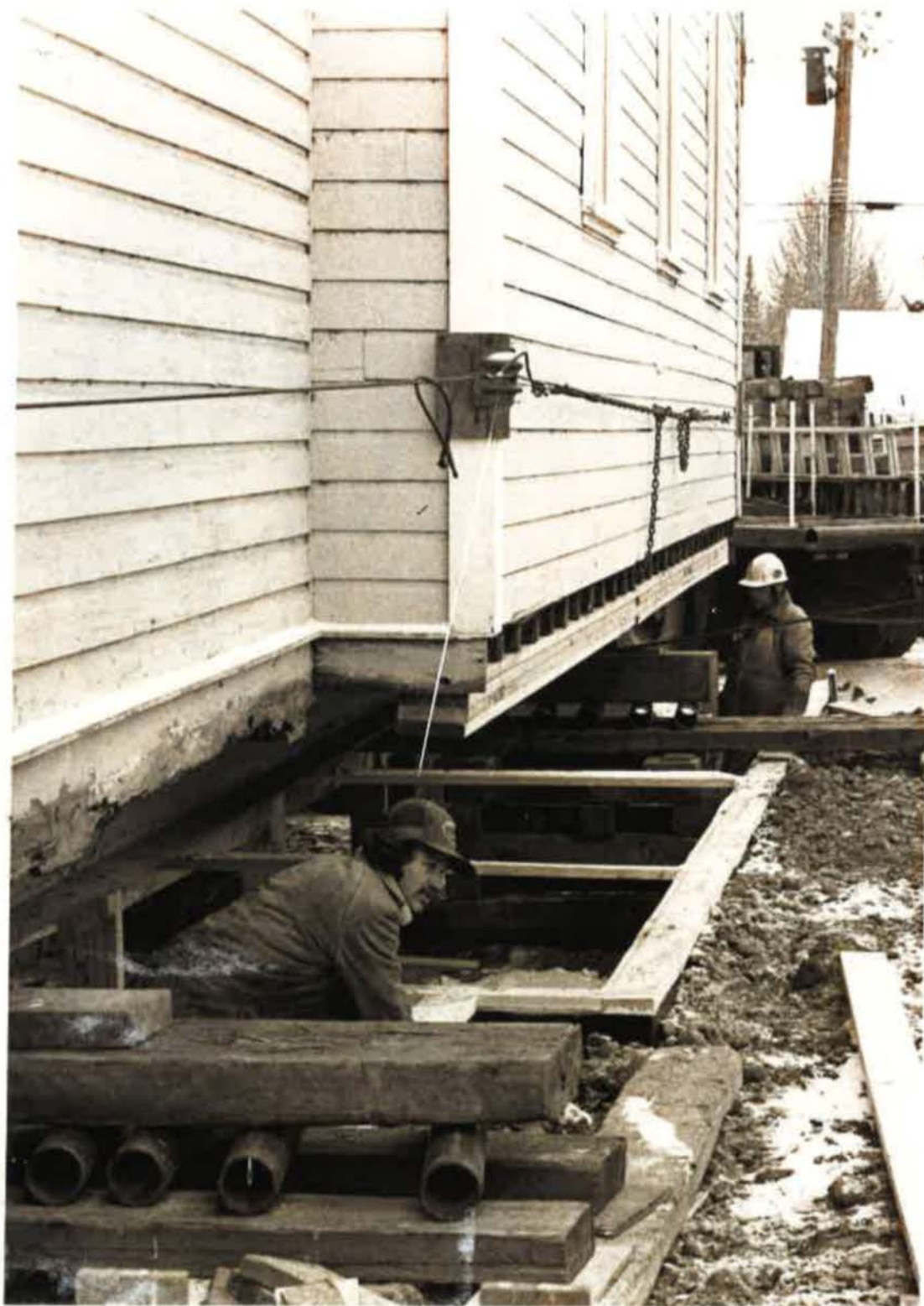
Rolling sanctuary onto new foundation