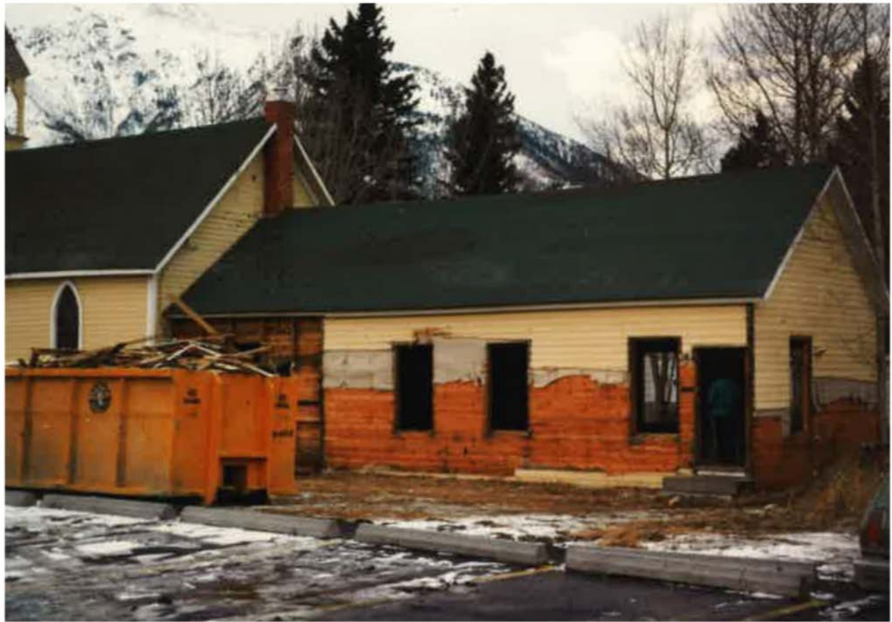
Prepping the old hall for demolition.