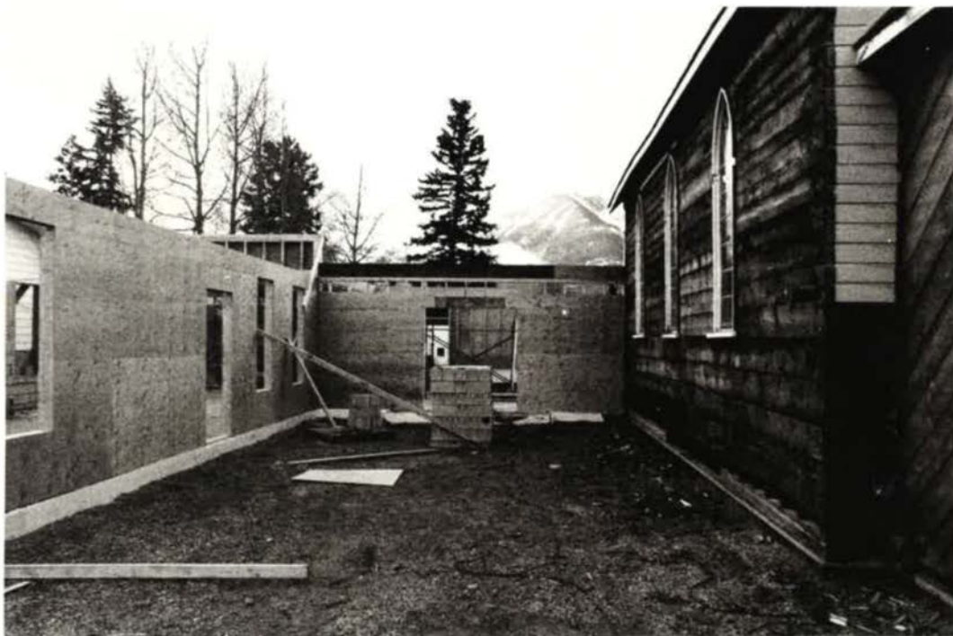
Construction of new hall #1