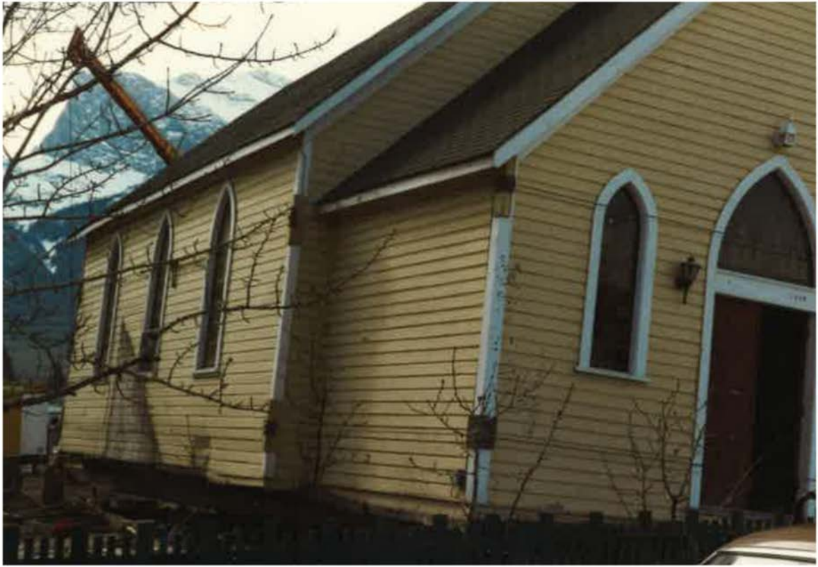
Church jacked up to be moved off old foundation.