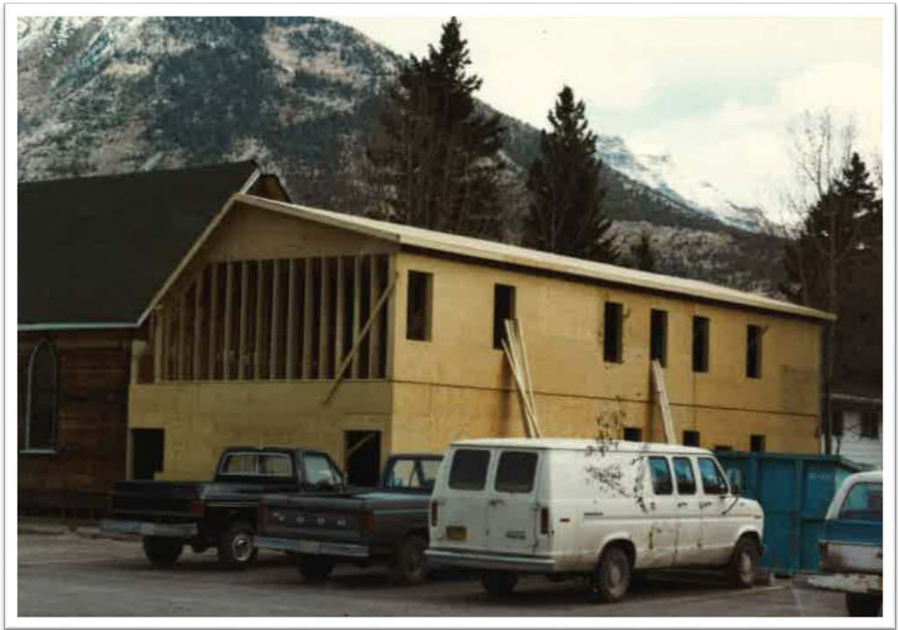
New Hall from the back (above)