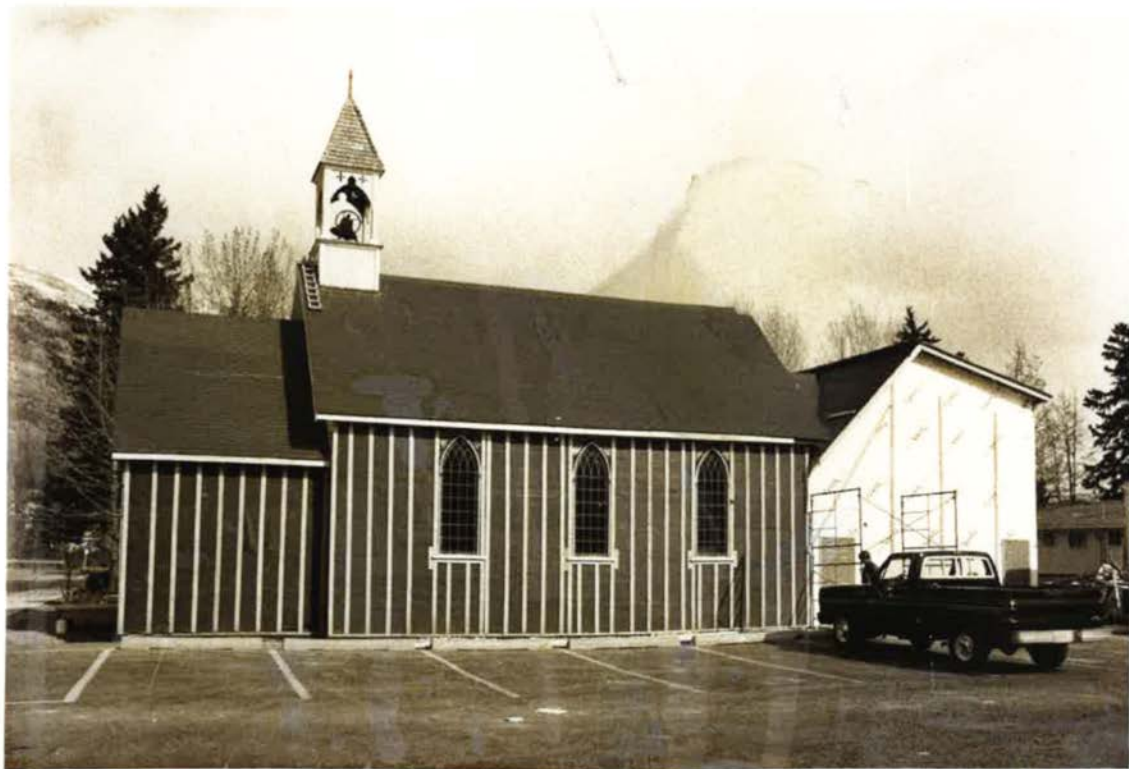
Ready for new siding