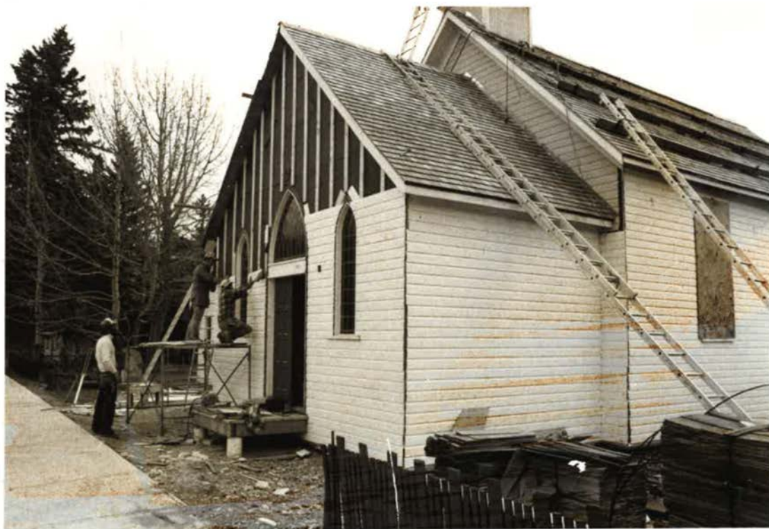
Putting on new siding and shingles