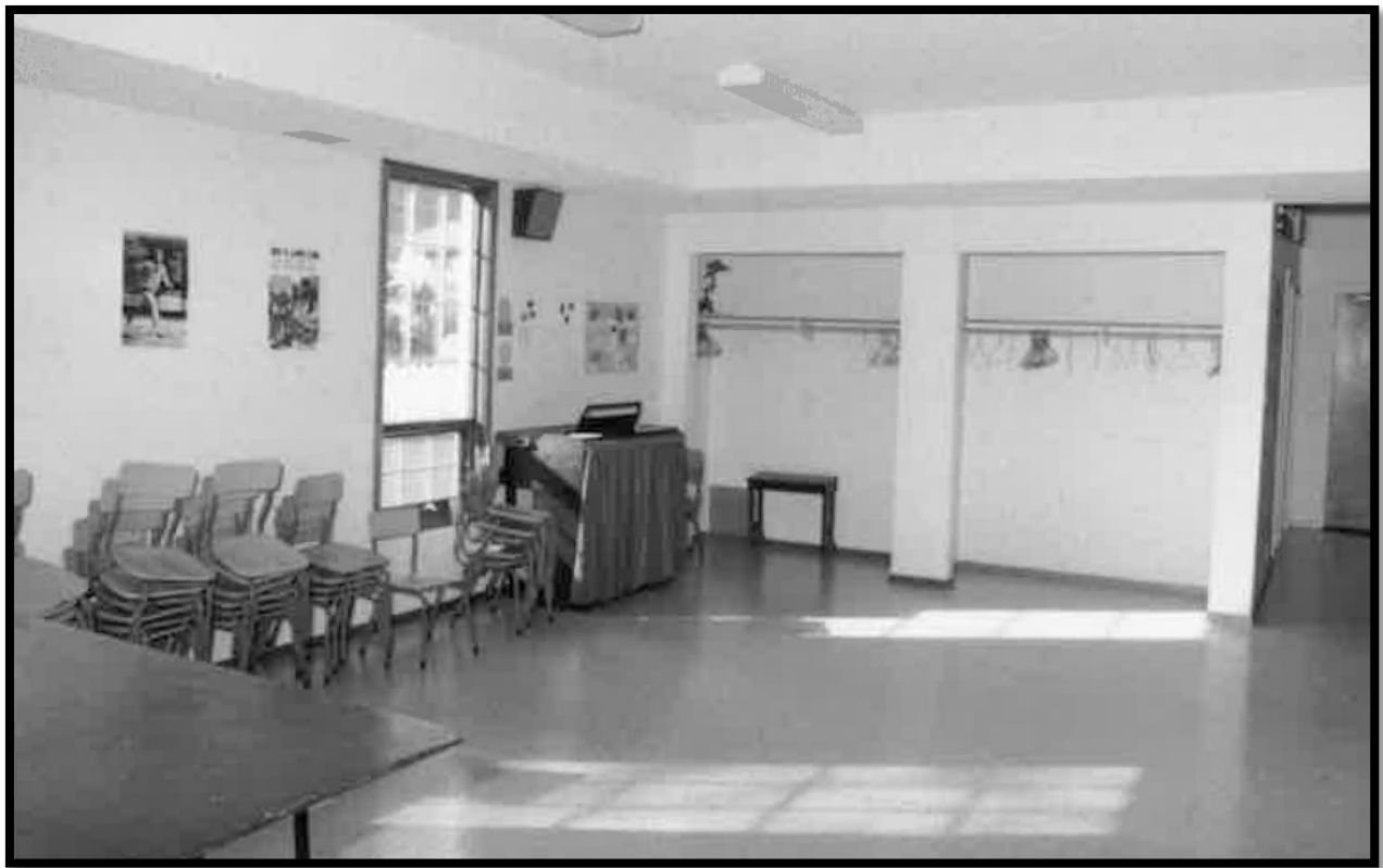
New Hall – The office is in this space now (above)