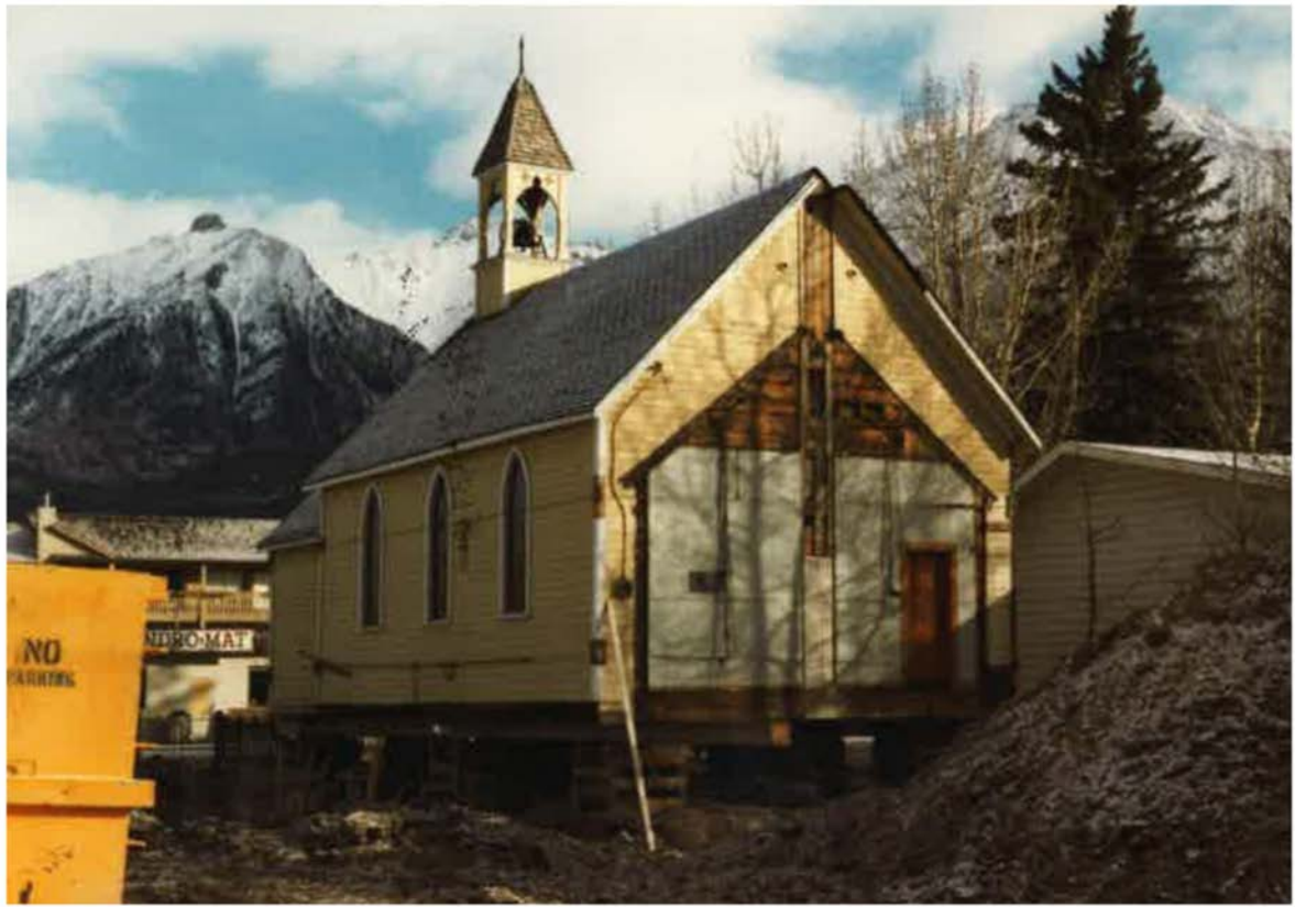
Temporary home while new foundation is prepared.