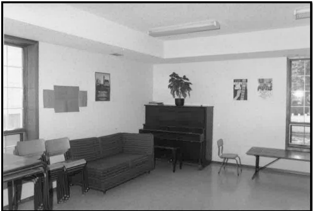
New Hall (below)