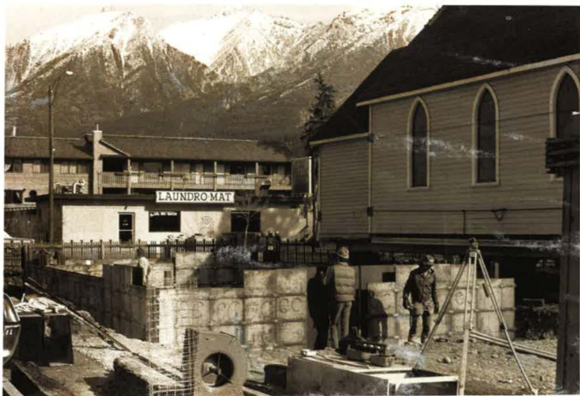
Preparing foundation for sanctuary