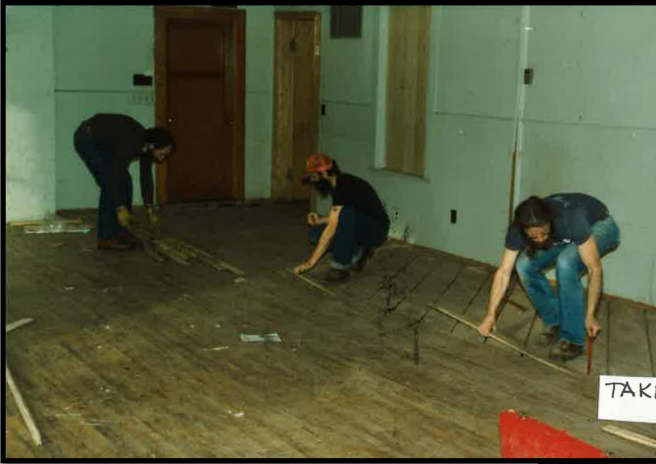
Taking up the floor in the old Hall